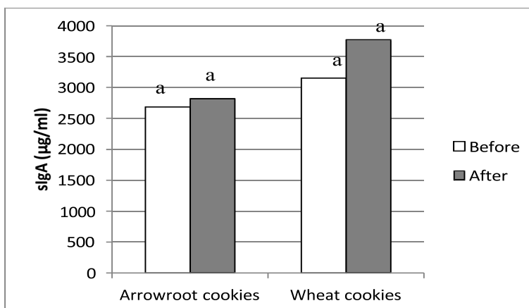
Figure 1. Fecal sIgA levels of children under five years before and after intervention with arrowroot and wheat cookies. Note: superscript with the same letter indicates not significantly different .

Superscript with the same letter indicates not significantly different