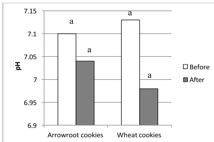
Figure 3. Fecal pH of children under five years before and after intervention with arrowroot and wheat cookies. Note: superscript with the same letter indicates not significantly different .