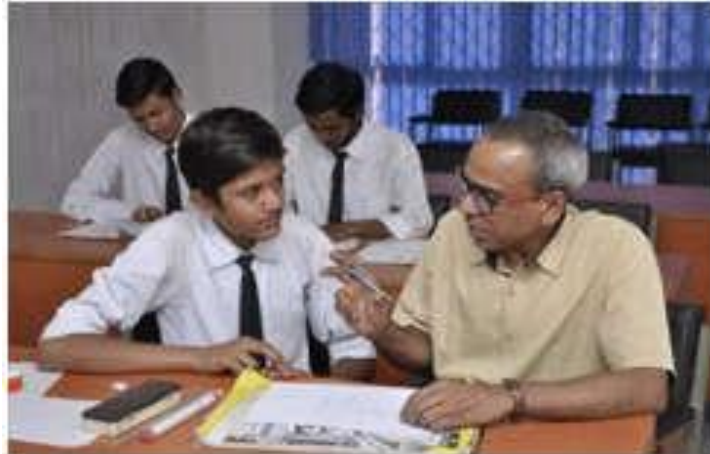
Figure 2. Student Centred Strategy